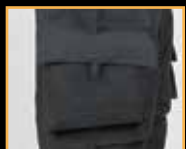
Angled Expansion Pockets