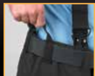
Pant Grip Handles