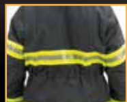
Cinch cord in jacket