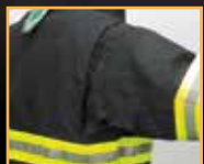
Pleated Back gives freedom of movement